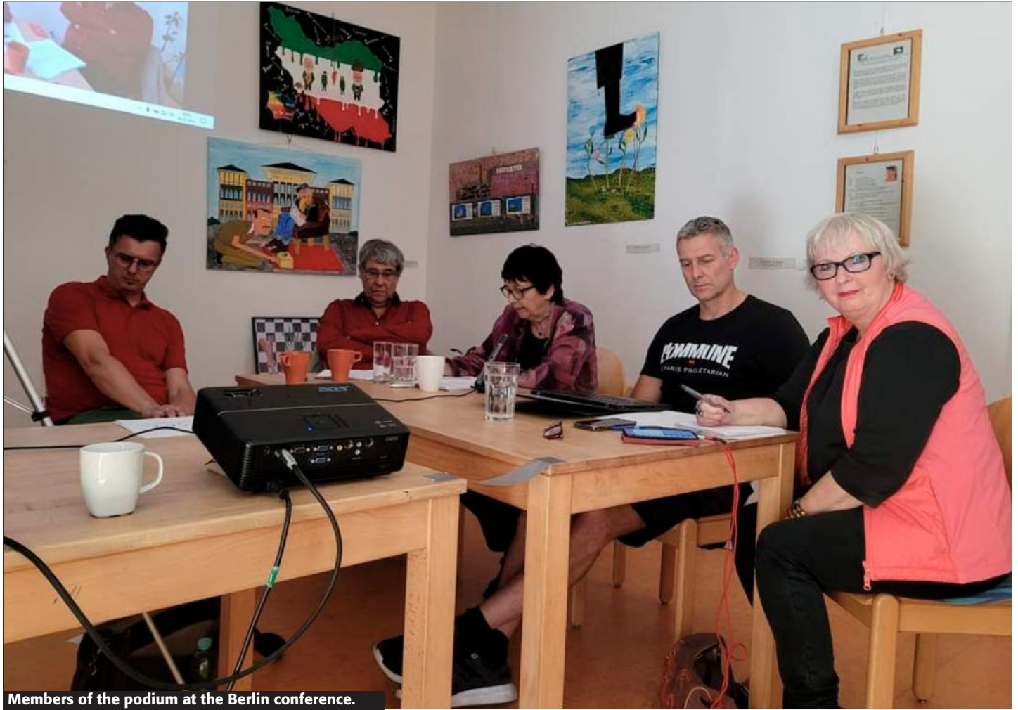
Members of the podium at the Berlin conference.