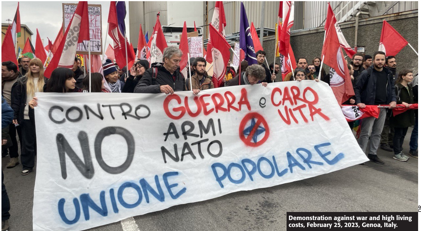
Demonstration against war and high living costs, February 25, 2023, Genoa, Italy.