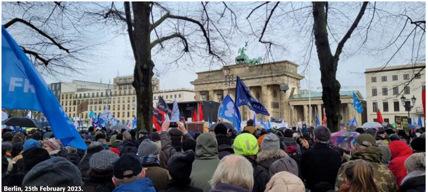
Berlin, 25th February 2023.

It's nevertheless astonishing that, despite total brainwashing, so many people have come out to demonstrate and that, in the polls, half the people questioned speak out against arms deliveries and in favour of negotiations. This gives hope, and it is on this basis that we must stand. ■