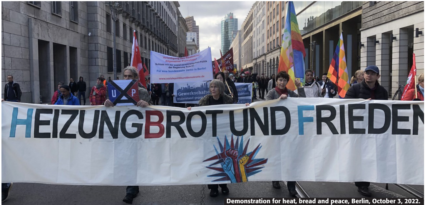
Demonstration for heat, bread and peace, Berlin, October 3, 2022.